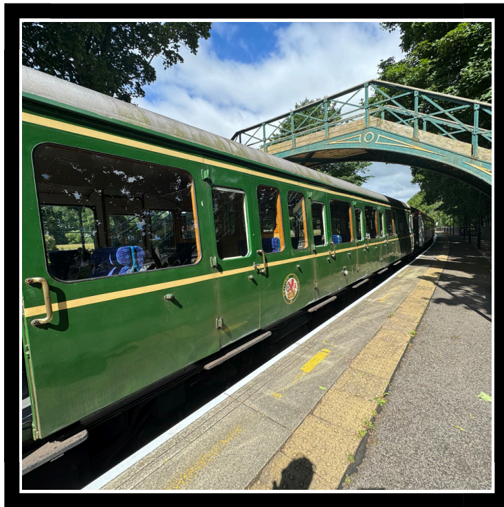
This is one of the trains at the station