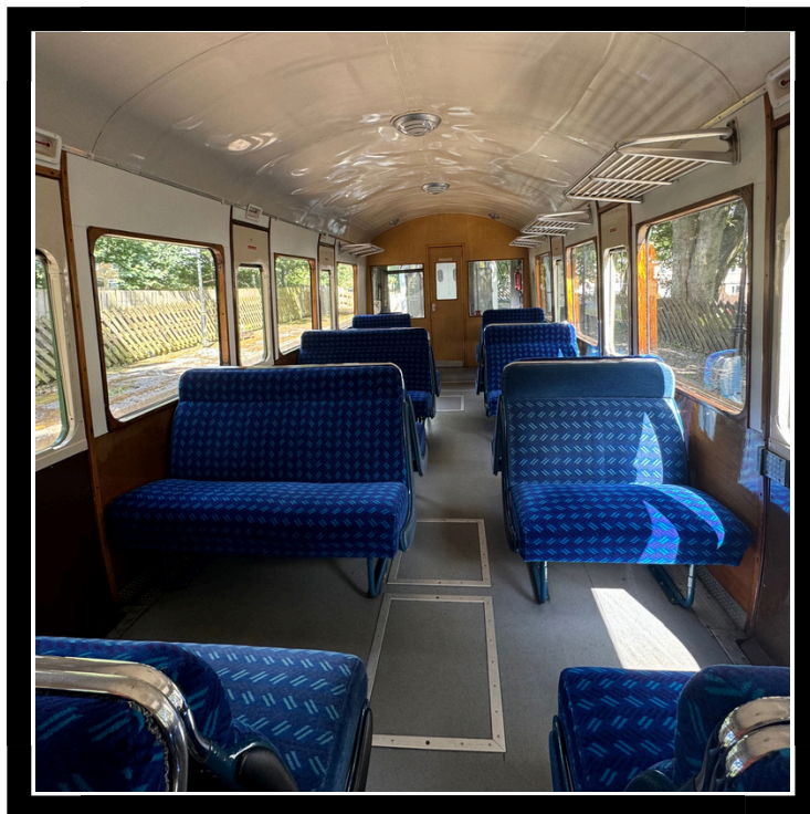
This is inside of the train